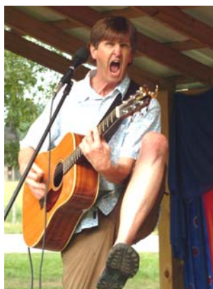
Laughter Heals the Spirit